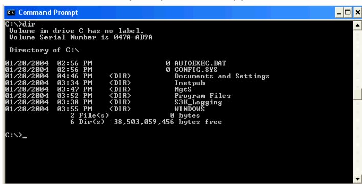
Fig. 3.2 Command Prompt