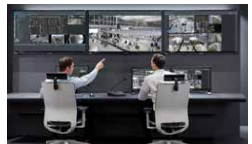
Professional Monitoring Station